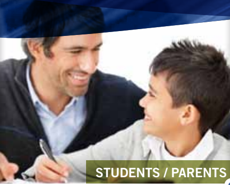
STUDENTS / PARENTS